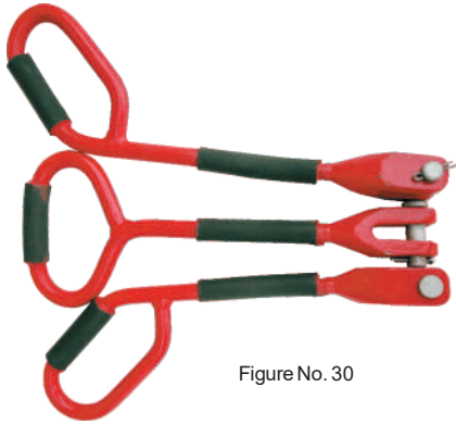
Figure No. 30